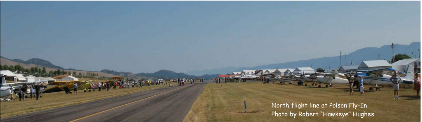
North flight line at Polson Fly-In